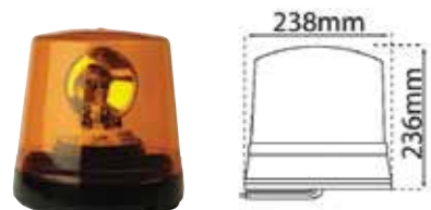
Rotating 3 Point