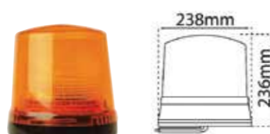
Xenon 3 Point